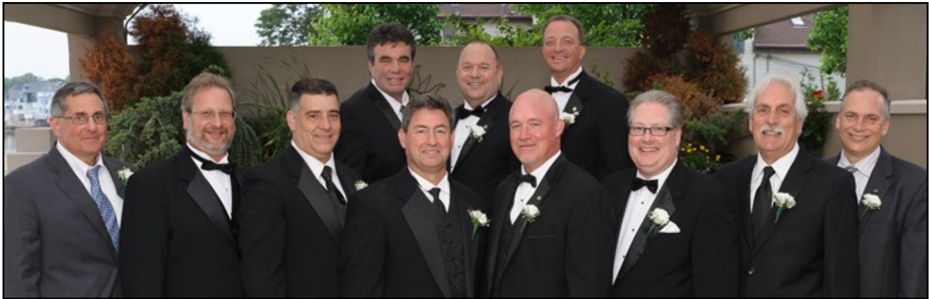
Officers and Directors from left to right: